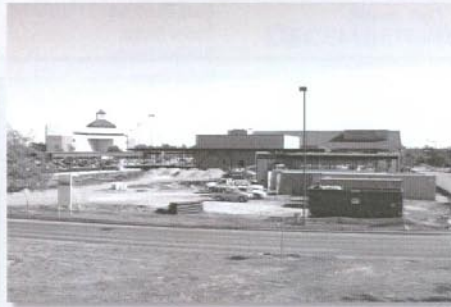
Arts Education Center/Phase I

Oklahoma City Community College broke ground this past spring to build the new Health Professions Education Center and the Arts Education Center/Phase I. The new buildings and programs allow the College to continue to offer innovative programs and opportunities within the health professions as well as arts education. The buildings are scheduled for completion next spring and should be ready for the summer semester of 2008.