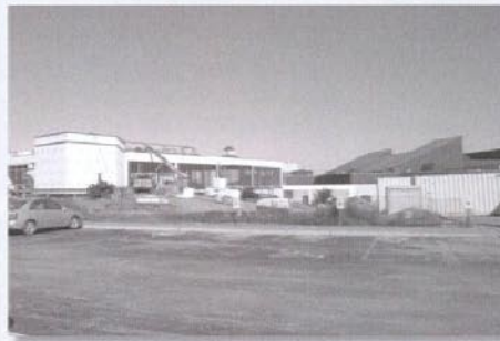
Health Professions Education Center